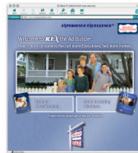
REX™ the Online Ad Builder is available to assist you with Ads, Printed Materials, Direct Mail, Posters and More...